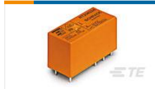
TE Part #3-1649329-1 RT444012