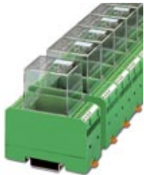
Relay module, with plug-in base for KAMMRELAIS® size 2, contact: F 104, 2 PDT

Please be informed that the data shown in this PDF Document is generated from our Online Catalog. Please find the complete data in the user's documentation. Our General Terms of Use for Downloads are valid ( http://phoenixcontact.com/download )