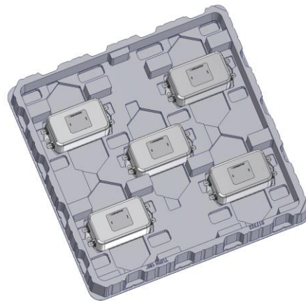
Figure 2: Example of new tray