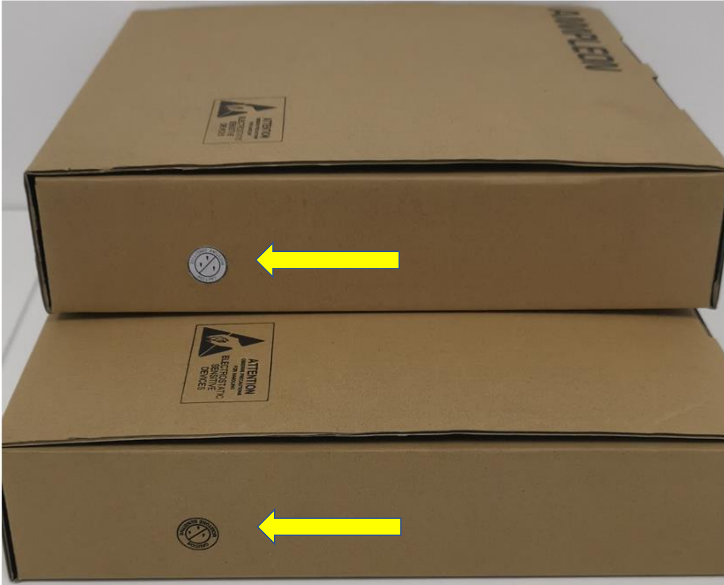
Alternative box with Dry Pack logo sticker

Placing Dry Pack logo sticker on alternative PQ box, placed exactly on same position where printed logo is located.