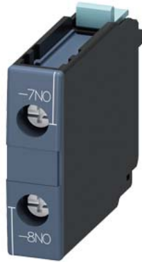
front-side auxiliary switch, 1 NO, leading, screw terminal, for contactors 3RT1