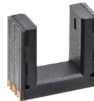
Reduced size, 5mm slot width with surface mount and photo IC type