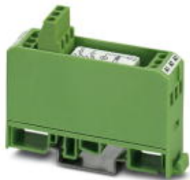
Relay module, with soldered-in miniature switching relay, contact (AgNi): Medium to large loads, 2 PDT, input voltage 230 V AC

Please be informed that the data shown in this PDF Document is generated from our Online Catalog. Please find the complete data in the user's documentation. Our General Terms of Use for Downloads are valid ( http://phoenixcontact.com/download )