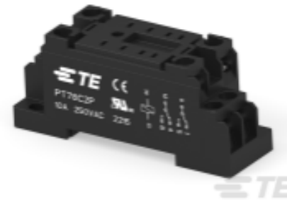
TE Part # 2071566-3 PT78C2P