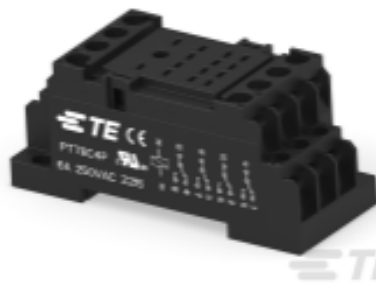
TE Part # 2071566-1 PT78C4P