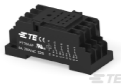
TE Part # 2071566-2 PT78A4P