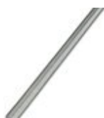
Continuous plug-in bridge, length: 500 mm, color: gray

Continuous plug-in bridge - FBST 500-PLC GY - 2966838