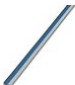
Continuous plug-in bridge, length: 500 mm, color: blue

Continuous plug-in bridge - FBST 500-PLC BU - 2966692