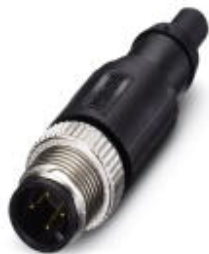
CC-Link termination resistor, 4-pos., M12 plug

Please be informed that the data shown in this PDF Document is generated from our Online Catalog. Please find the complete data in the user's documentation. Our General Terms of Use for Downloads are valid ( http://phoenixcontact.com/download )